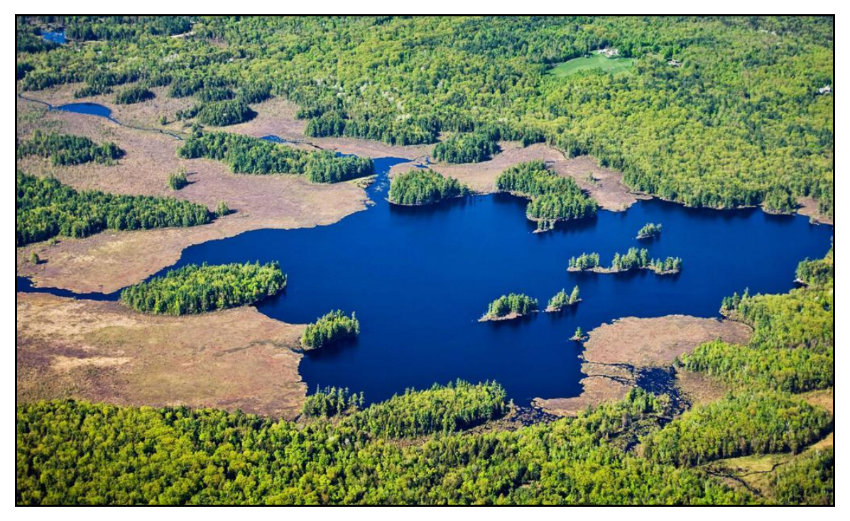
Poor level fen/bog system at Red Hill Pond in Sandwich.

Reference Condition Examples (A to B+ Ranked): Heath Pond Bog Natural Area (Ossipee and Effingham) and Red Hill Pond (Sandwich).