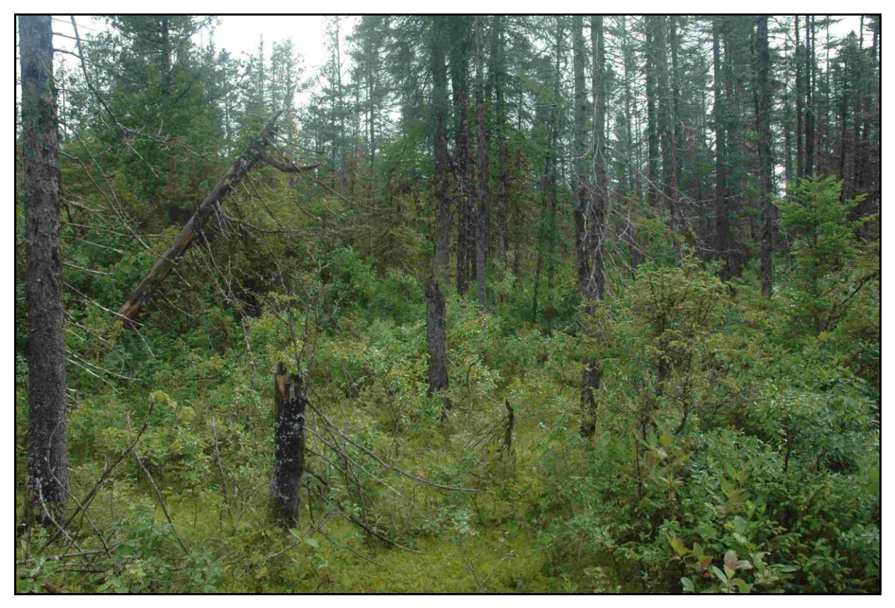
Black spruce peat swamp system at South Bay Bog in Pittsburg.