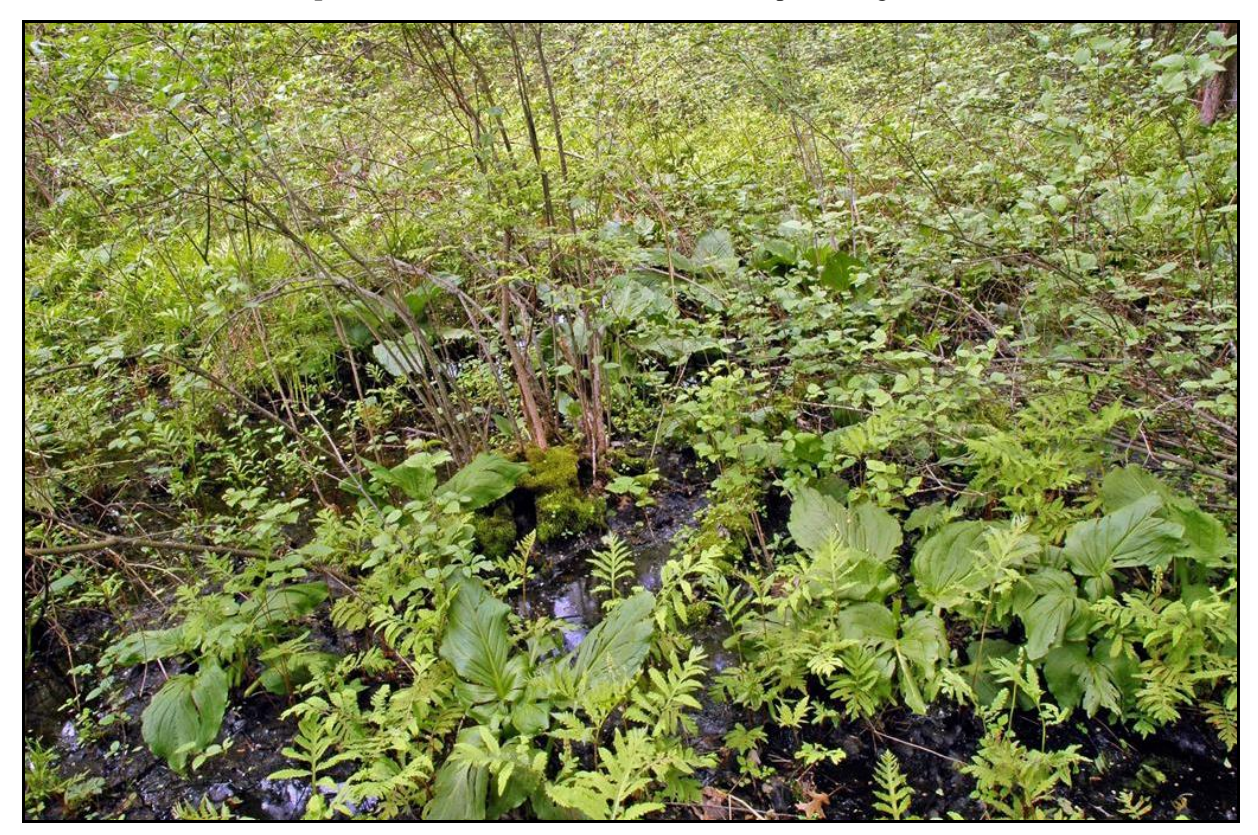
Temperate minerotrophic swamp system at Paul Brook Swamp in Newington.

Reference Condition Examples (A to B+ Ranked): Paul Brook Swamp (Newington).