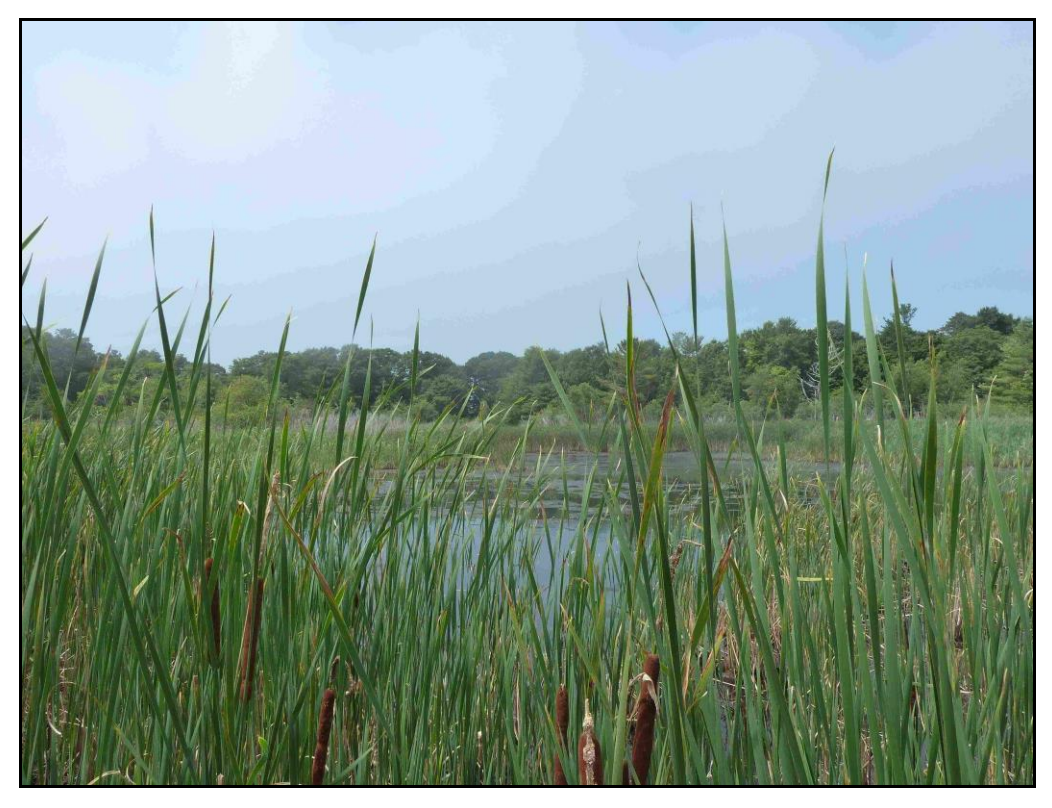
Coastal salt pond marsh system at Odiorne Point State Park in Rye.