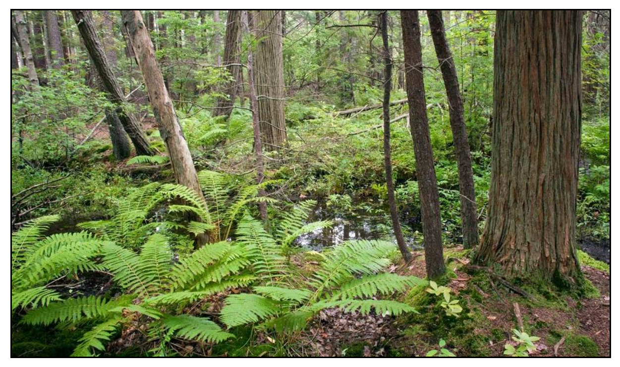
Coastal conifer peat swamp system at Locke Pond in Rye (photo by Ben Kimball).

Reference Condition Examples (A to B+ Ranked): Loverens Mill (Antrim), Manchester Cedar Swamp (Manchester), Cedar Swamp Pond (Kingston), White Lake State Park (Tamworth), and Locke Pond (Rye).