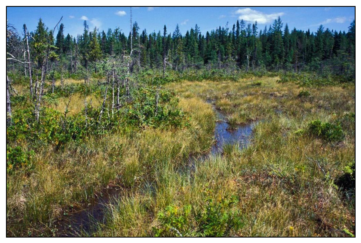
Patterned fen system at Borderline Fen in Errol.