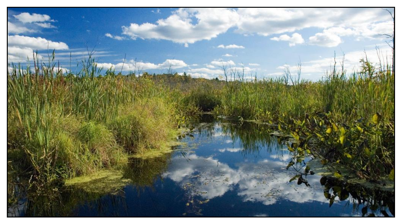
Drainage marsh - shrub swamp system at Great Meadows along the Exeter River in Kensington and Exeter.