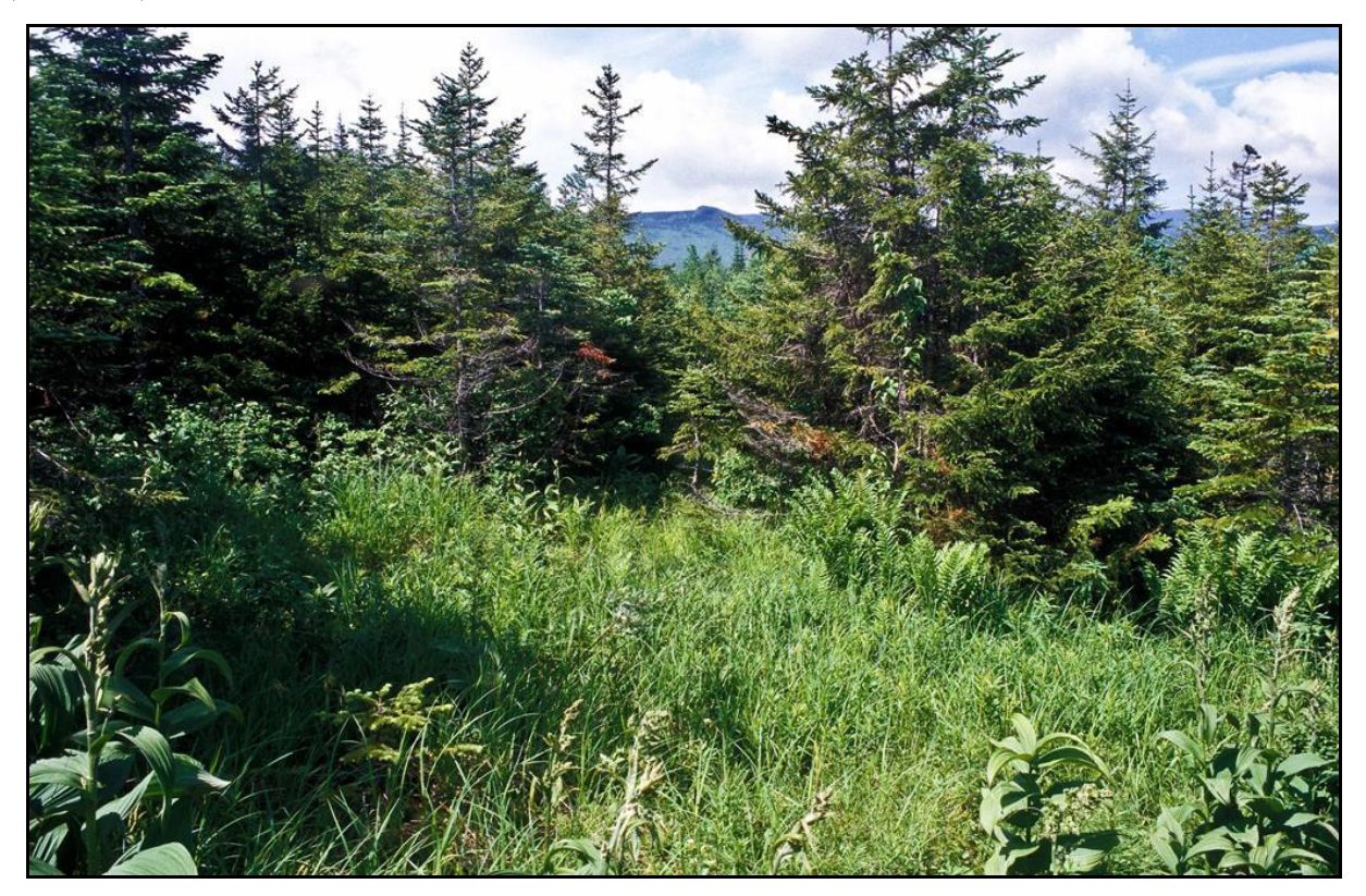
Montane sloping fen system on Whitewall Mountain in Bethlehem.

Reference Condition Examples (A to B+ Ranked): Upper East Branch of the Pemigewasset River watershed near Shoal and Ethan Ponds (Lincoln), North Bald Cap Mtn. in the Mahoosuc Range (Success), and Whitewall Mountain (Bethlehem).