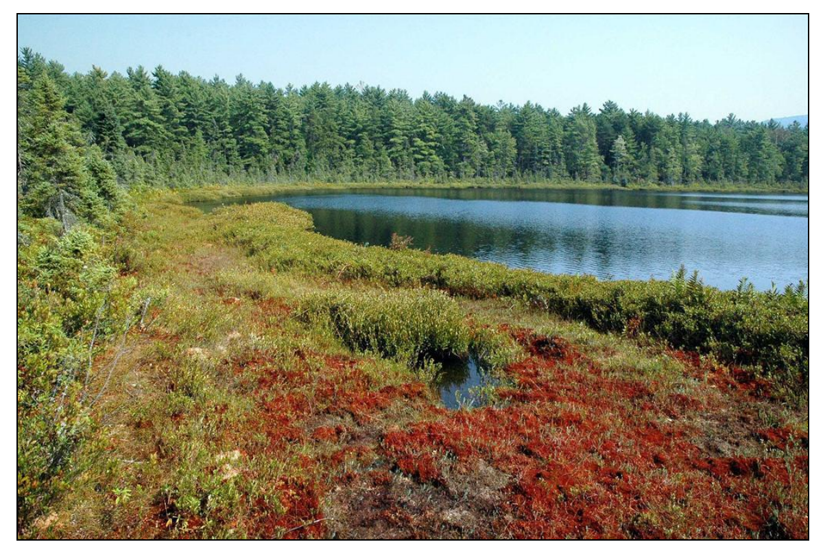
Kettle hole bog system at Heath Pond Bog in Ossipee and Effingham.

Reference Condition Examples (A to B+ Ranked): Philbrick-Cricenti Bog (New London) and Heath Pond Bog Natural Area (Ossipee and Effingham).