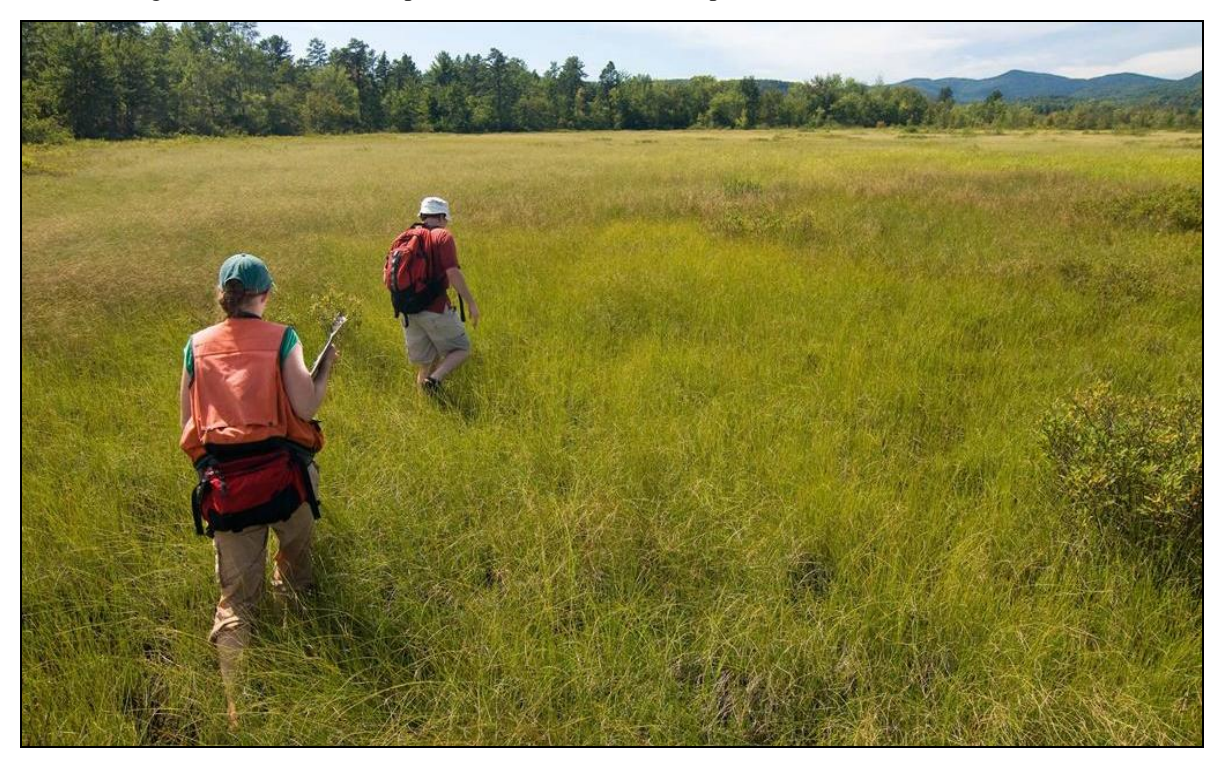
Medium level fen system at Ossipee Lake Natural Area in Ossipee.

Reference Condition Examples (A to B+ Ranked): Betty Meadows (Northwood), NW of Lake Umbagog (Errol), Little and Big Church Ponds (Livermore/Albany), Bradford Bog (Bradford), Berry Pond (Moultonborough/Sandwich), and Ossipee Lake Natural Area (Ossipee).