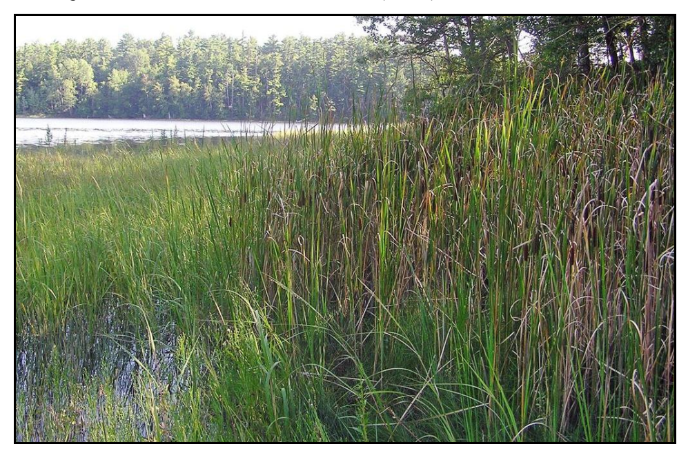
Brackish tidal riverbank marsh system along Garvin Brook in Dover.

Reference Condition Examples (A to B+ Ranked): Reference condition examples are unknown in New Hampshire. An example with "fair" condition is Garvin Brook (Dover).