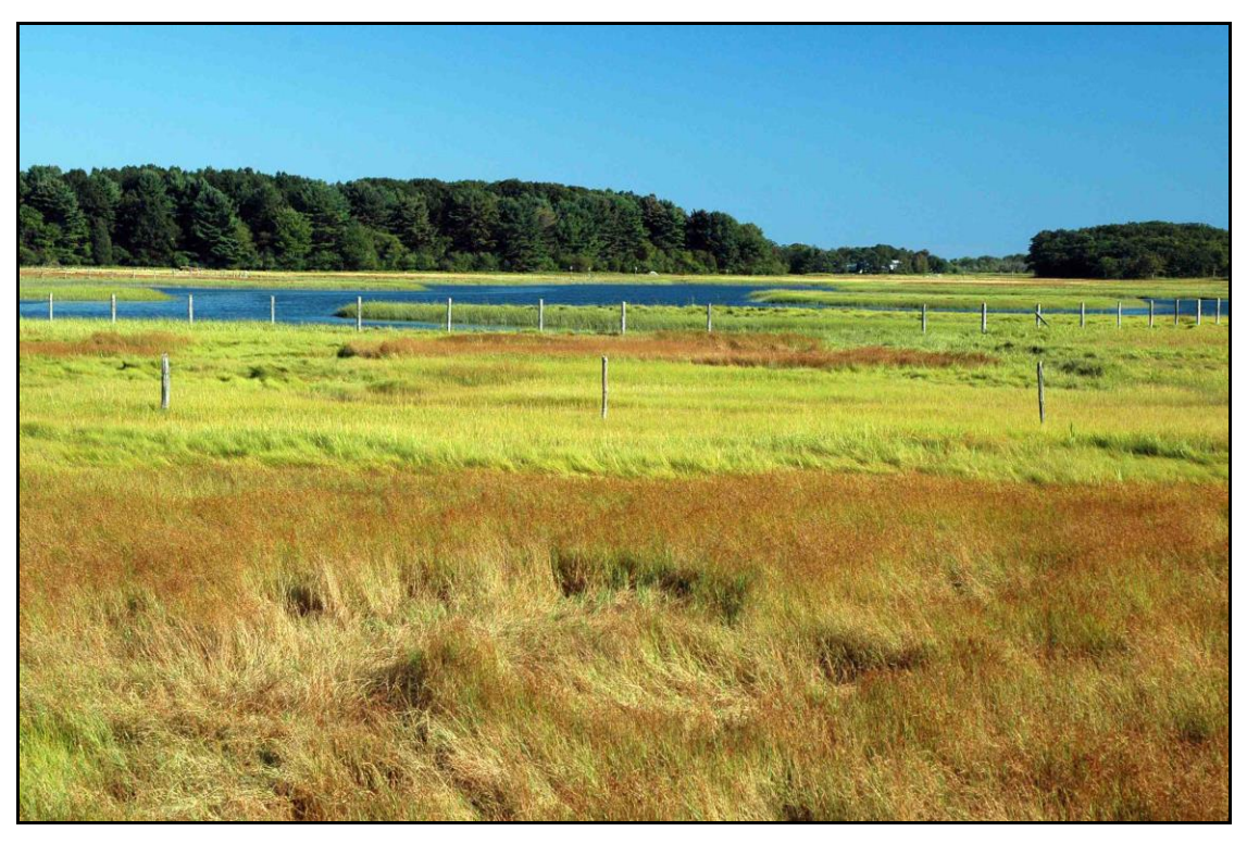
Salt marsh system at Berry's Brook in Rye.