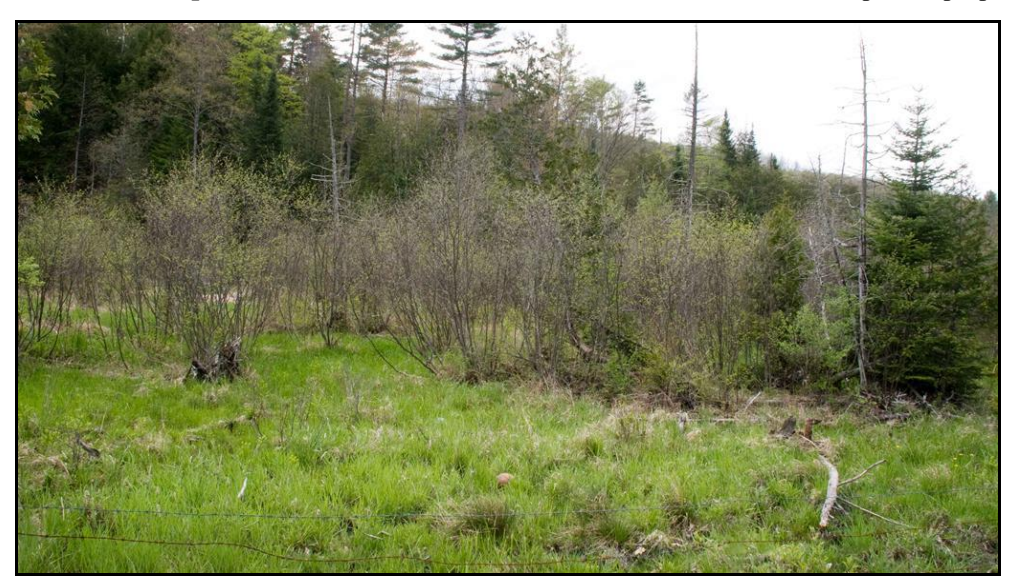
Calcareous sloping fen system in Monroe.

Reference Condition Examples (A to B+ Ranked): Stewartstown and Monroe (all are on private property).