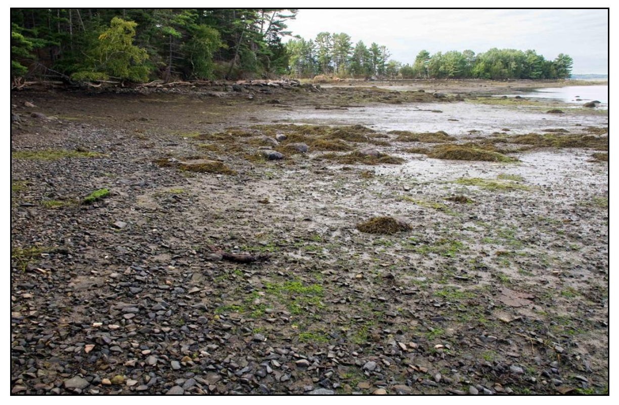
Sparsely vegetated intertidal system at Great Bay National Wildlife Refuge.

Reference Condition Examples (A to B+ Ranked): Reference condition examples are unknown in New Hampshire. An example with "good to fair" condition occurs at Great Bay.