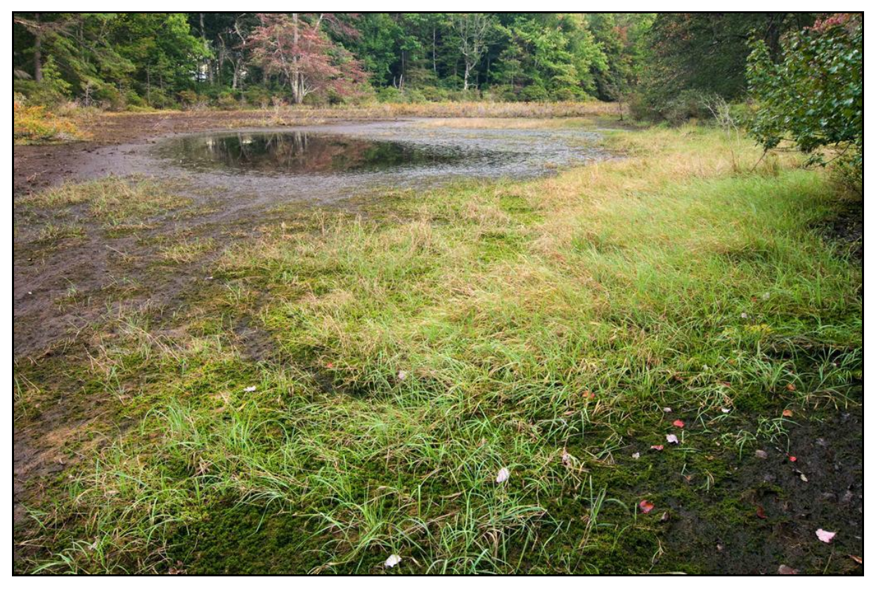
Sand plain basin marsh system in southern New Hampshire.