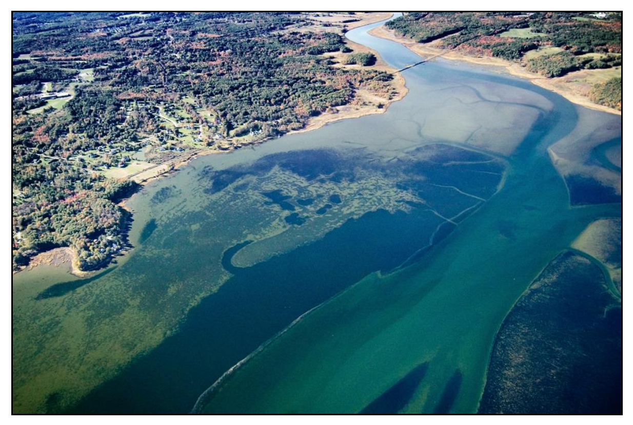
Subtidal system at the southern edge of Great Bay.